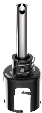
ZG2, ZGP, ZF100, ZFM100, Lifting Tool