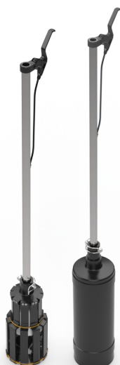
HP & HS Lifting Tool