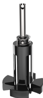
ZG8 - ZG10 Lifting Tool