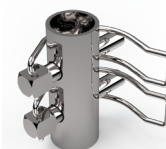
Extension Socket Kit