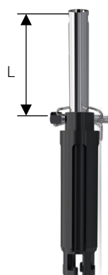
ZG3 - ZG7 Lifting Tool